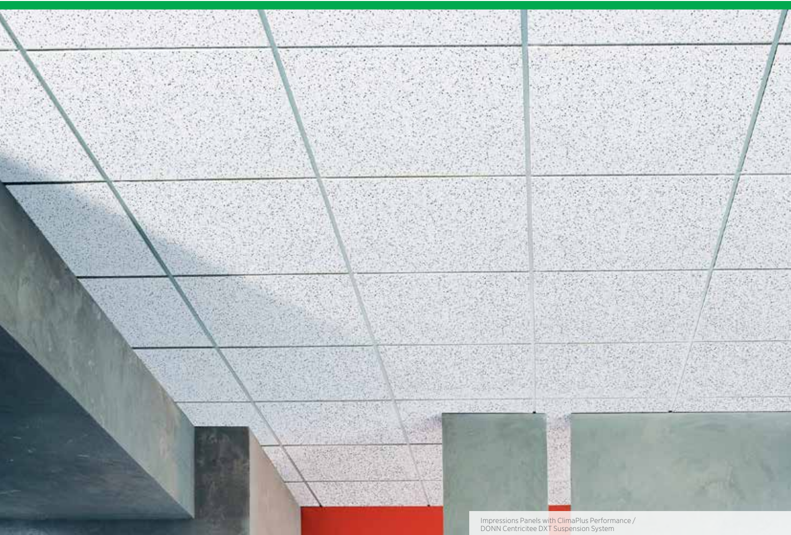
Impressions Panels with ClimaPlus Performance / DONN Centricitee DXT Suspension System