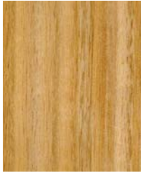
TO(L)(V) – Tasmanian Oak Quarter Cut