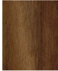
AW(L)(V) – American Walnut Crown Cut