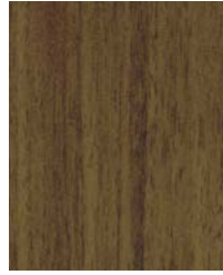
TE(L) – Tasman Elm