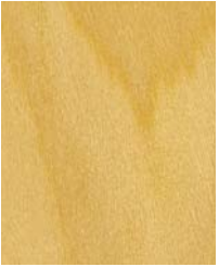
HP(L)(V) – Hoop Pine Rotary Cut