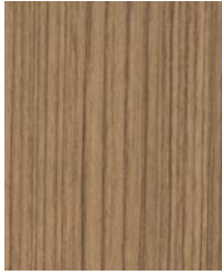
AC(L) – Acacia