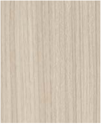
FL(L) – Flaxen